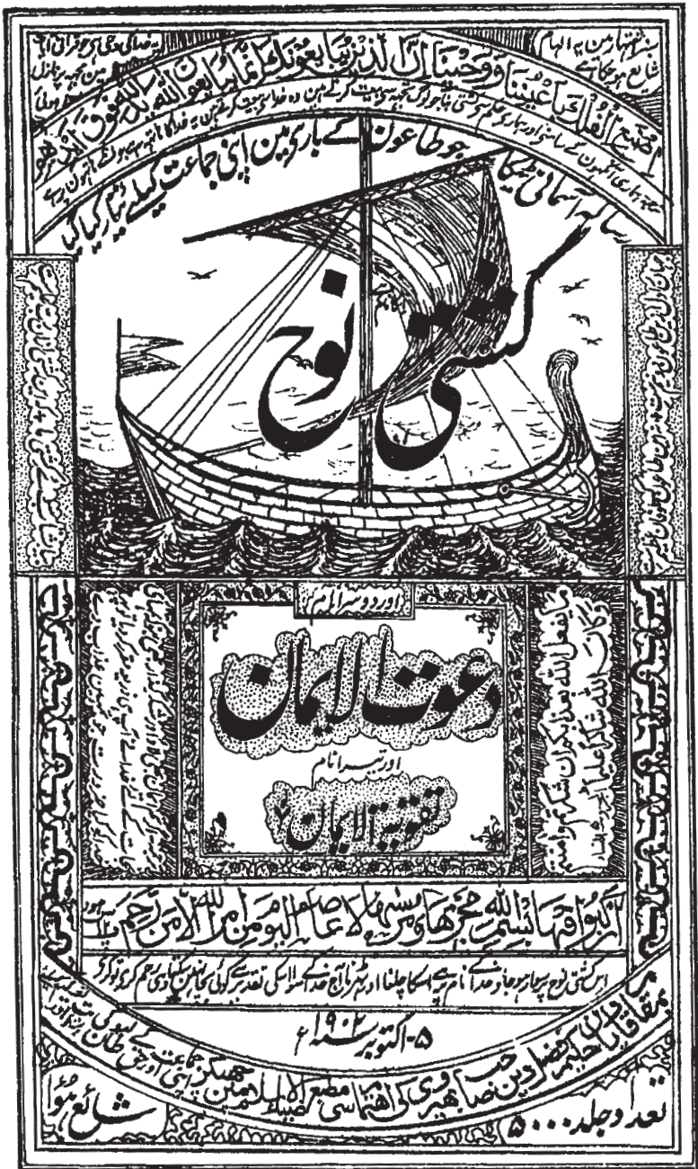
Facsimile of the original Urdu title page printed in 1902